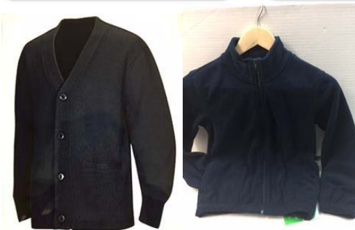
Knit Cardigan Polar Fleece